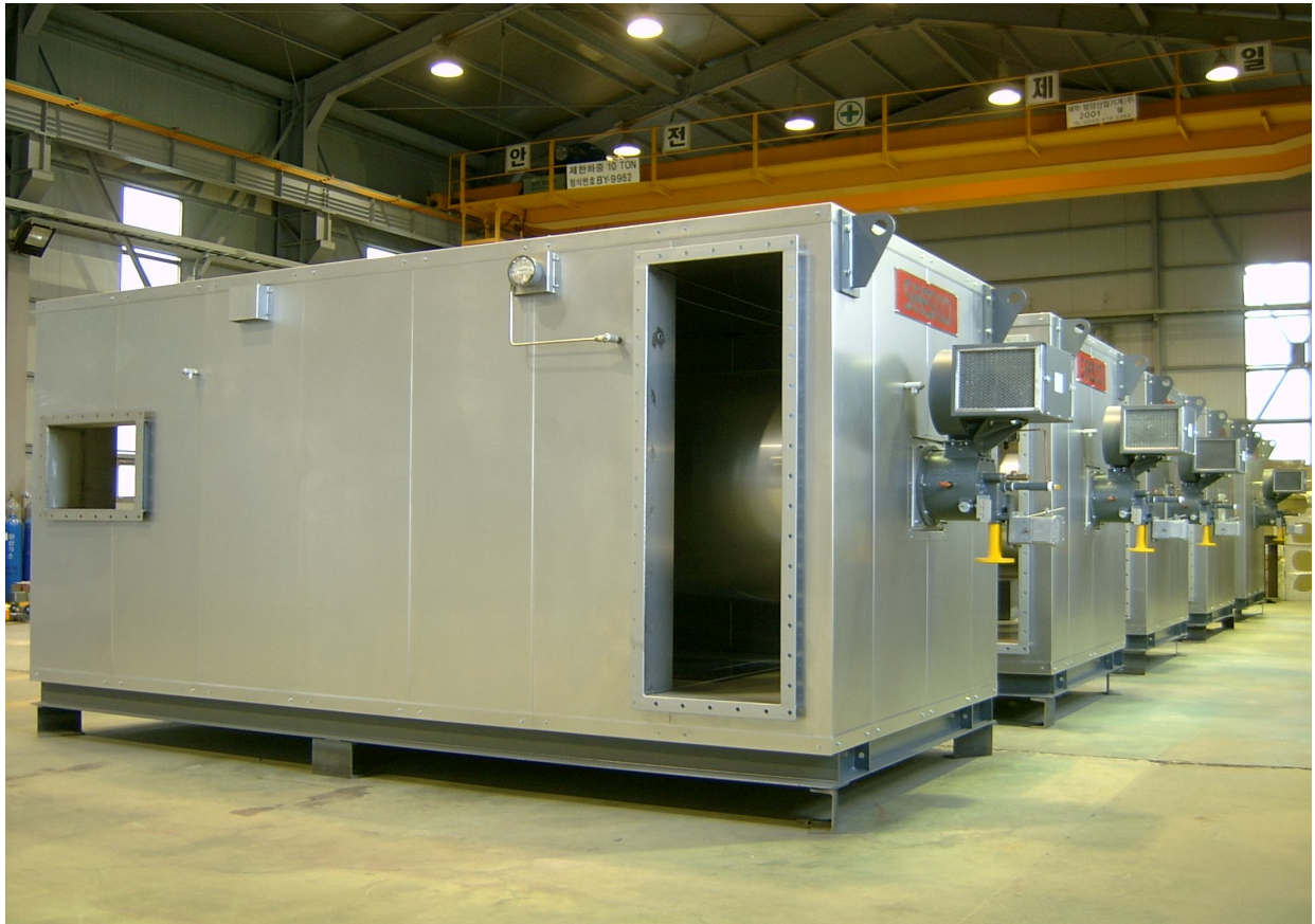
Direct fired Heater Unit for Fresh make up