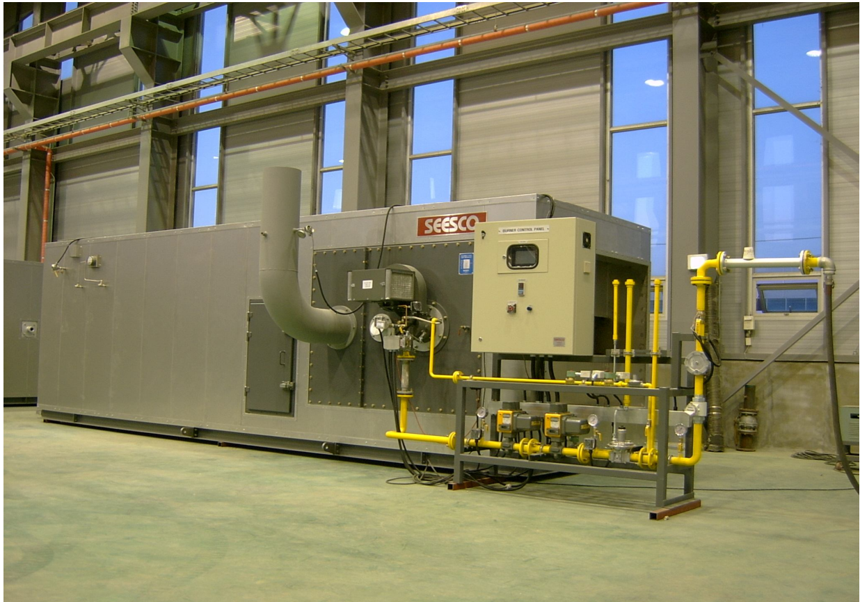
Live fire testing of In-direct fired Heater Unit