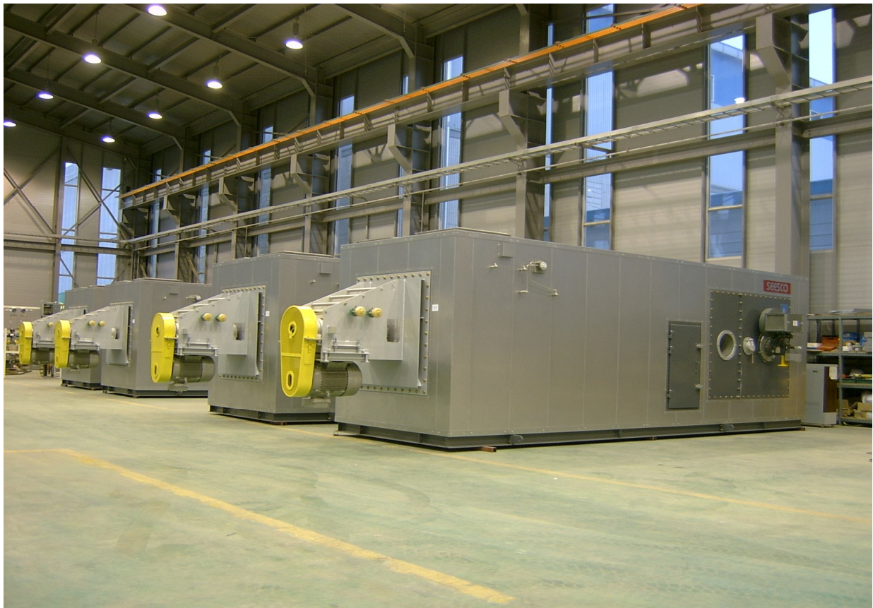
In-direct fired Heater Unit with Heat Exchanger