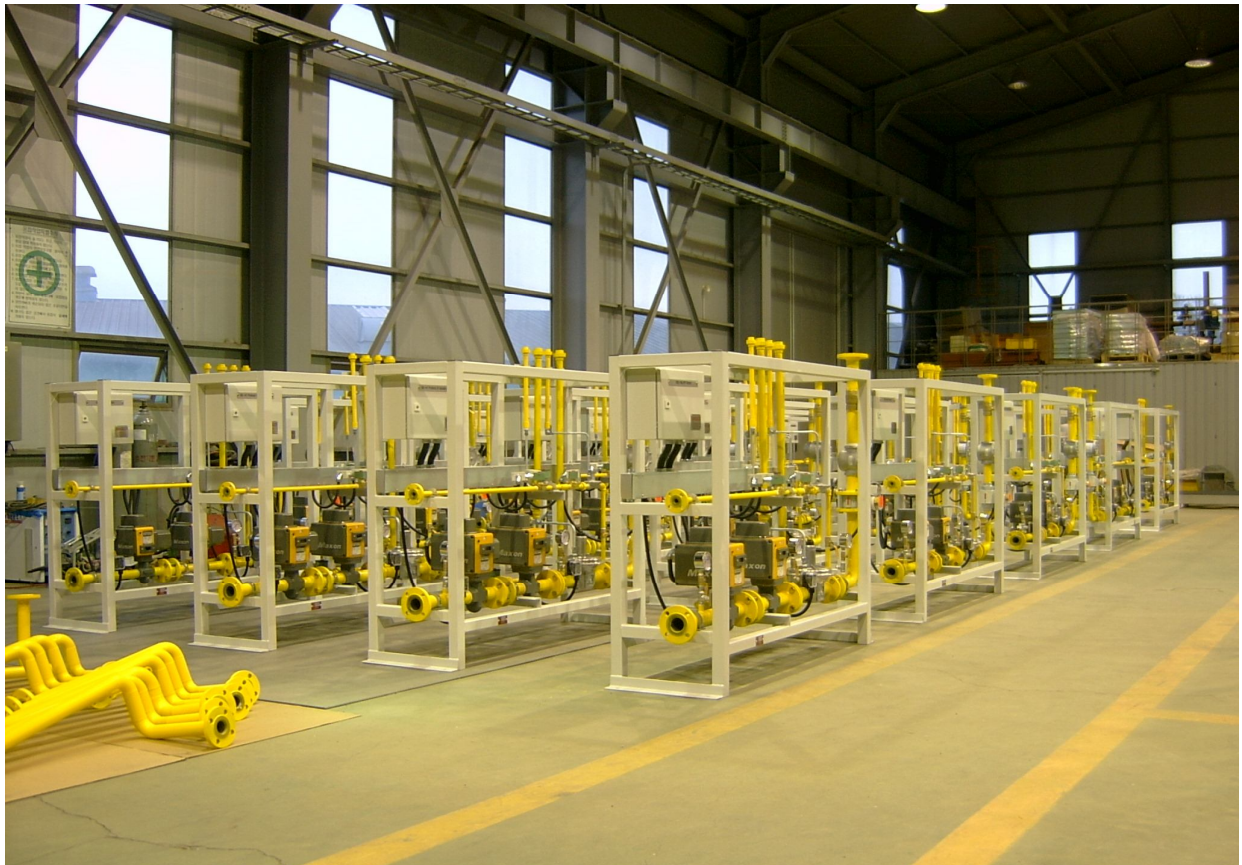
Gas Train with MAXON shut off valve